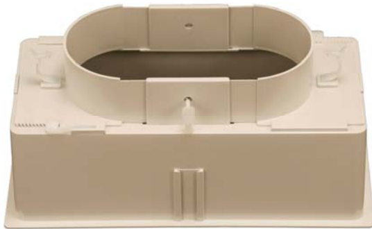
Connector regulation system